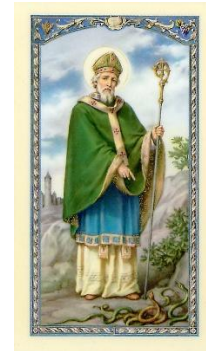
St. Patrick, patron saint of Ireland. Feast Day March 17

Two special feast days happen this week: