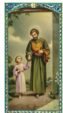
St. Joseph Spouse of Mary and foster father of Jesus March 19

* Mass intentions may be made for many reasons, examples are: upon the death of a friend, for an anniversary or birthday, for a special intention, or to honor someone. The average donation for a Mass intention is $10. Checks may be made payable to St. Rose of Lima. Use the envelopes provided or put a note with your donation in the collection basket, or mail to the church office.